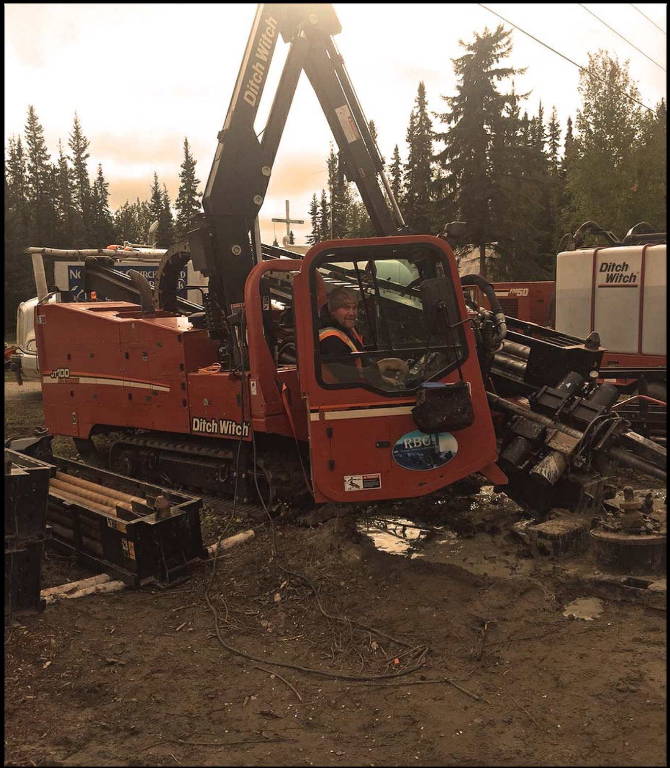
Andy Morgan drilling 800 ft shot with new JT100 Drill