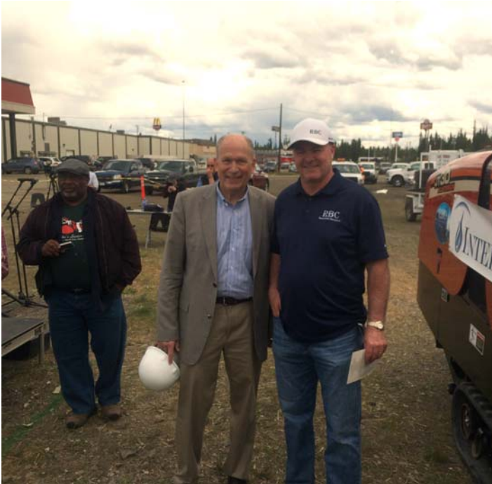
Dan Cook with Alaska Governor at project kick off