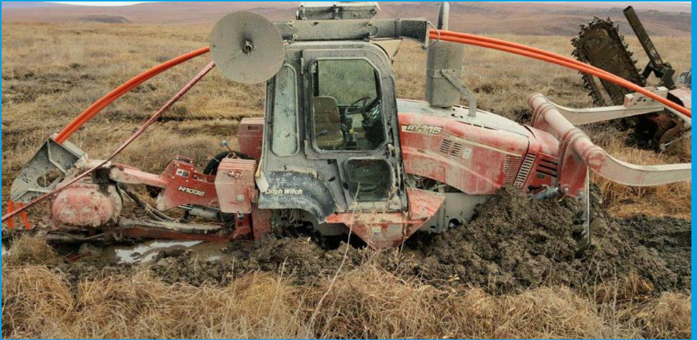
A RT115 cable working through mud in the summer.