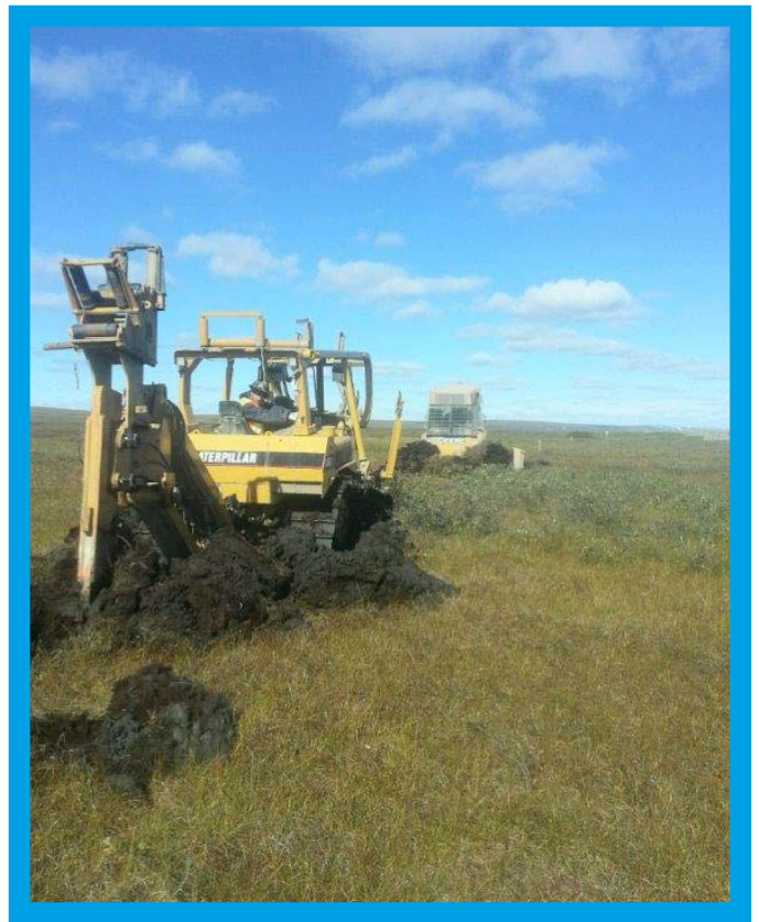
The D-6 trying to plow where there wasn't any permafrost.