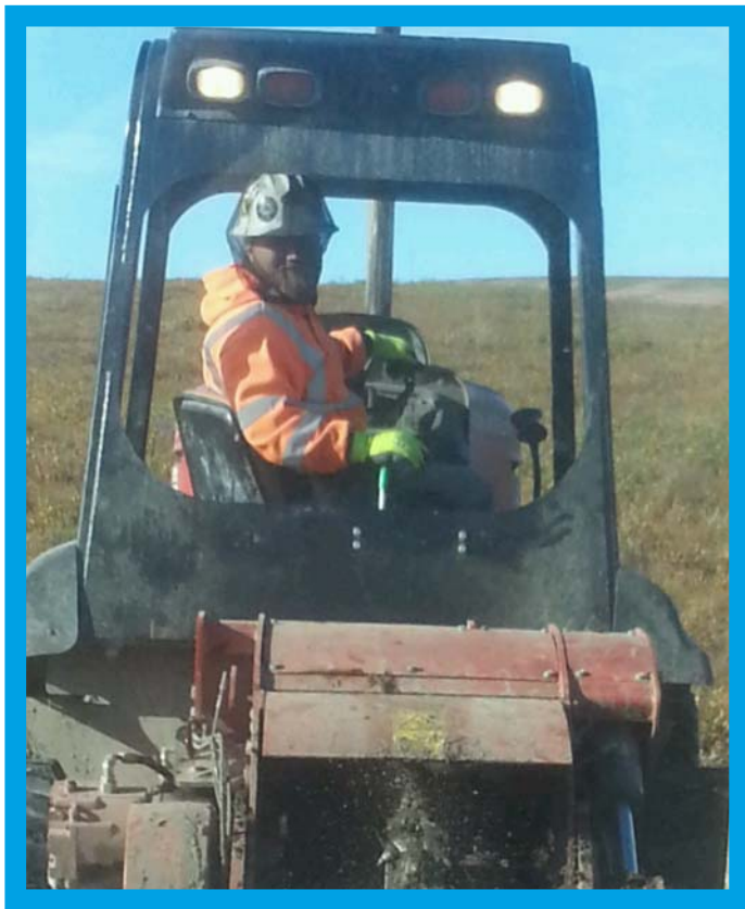
Running trencher with bug net on. To keep from being eaten by the mosquitos.