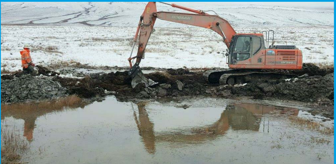
A sloppy area of muck. It's only September & the ground is frozen. The ground is frozen at 12-18" deep they are trying to get through.