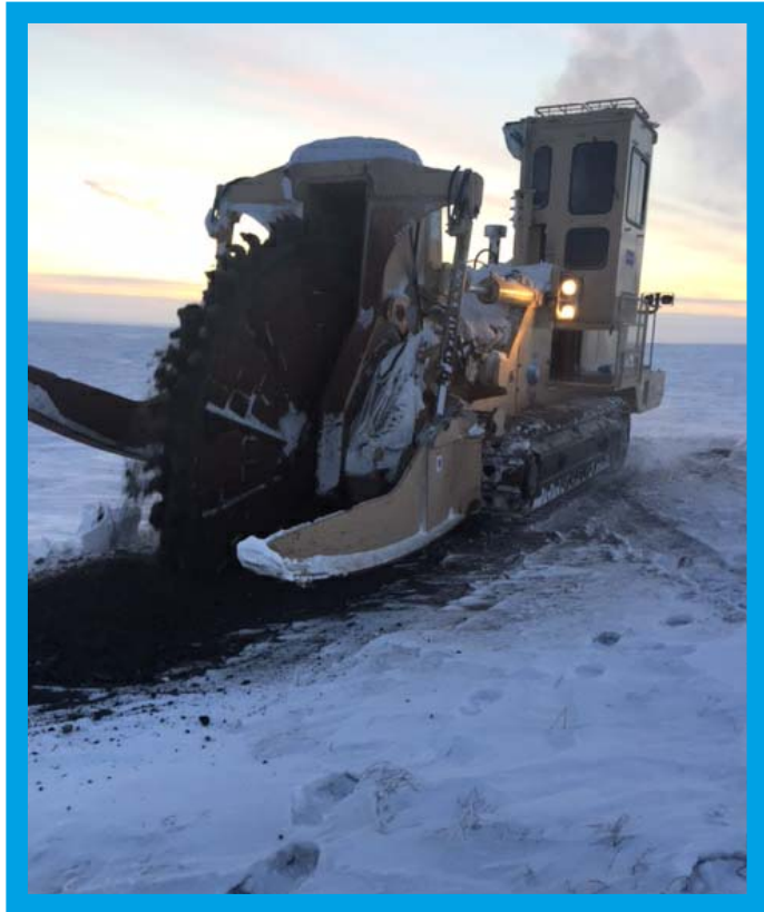
Here is the big boy. RBC'S 84000 LB Rock Saw brought on to increase production. We had to wait for ground to be very frozen so machine wouldn't sink.